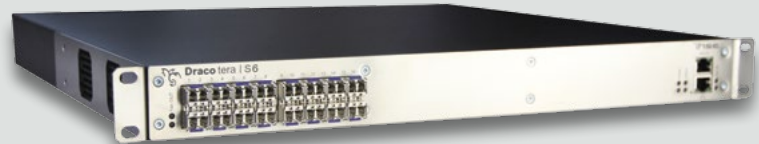
The Draco tera | S6. Available in a range of sizes from 8 to 80 ports.